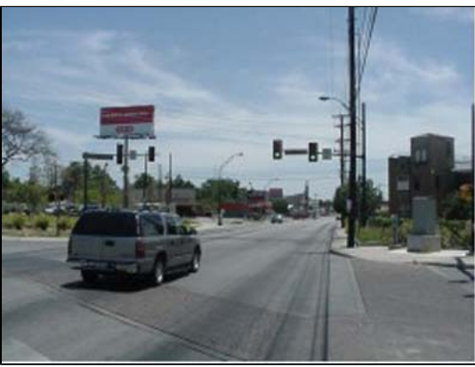
Click on image to view more photos

Search Bond Projects Choose Proposition Choose Street Choose Project Type Choose District